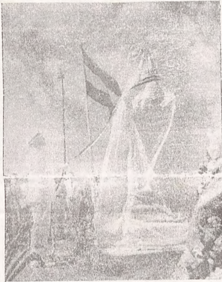
Climax of the ceremony is the unveiling of the statue.